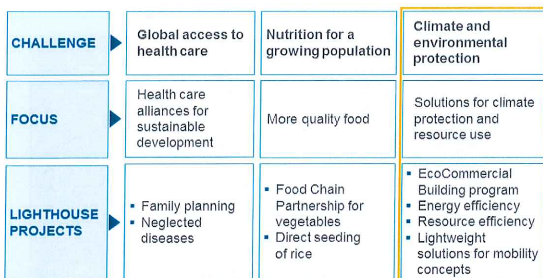
Figure 1: Bayer Global Sustainability Goals

Bayer's Global Environmental Targets for 2015 and 2020 are shown in Table 1.